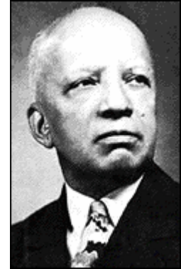
Dr. Carter G. Woodson

Until the study of black history, black Americans were absent from history books. Dr. Woodson established the Study of Negro Life and History in 1915, and a year later founded the widely respected Journal of Negro History