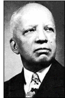
Dr. Carter G. Woodson

Until the study of black history, black Americans were absent from history books. Dr. Woodson established the Study of Negro Life and History in 1915, and a year later founded the widely respected Journal of Negro History