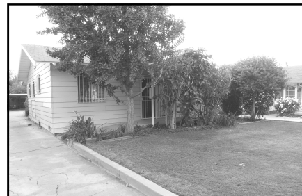
$214,900 3708 Briscoe -- 3 bedrooms, 1.75 bathrooms, approx 1200 sq ft, formal dining room, 1-year-old central air/heat, fireplace, fruit trees and lots of plants! Not a foreclosure or short sale — this “Wood Streets” home has been in the same family since the 1920s!