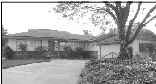
$329,900 4332 Beechwood -- This “Wood Streets” ranch-style home boasts 4 large bedrooms, 2 1/2 baths, approx 1900 sq ft, central air/heat, fireplace, pristine hardwood floors under carpet, indoor laundry, 2-car attached garage, and newer roof! All of this sits on one of the largest lots on this street — over a quarter acre — plus RV parking!!

we LIVE in the neighborhood, we WORK in the neighborhood, we KNOW the neighborhood, we SELL the neighborhood!!