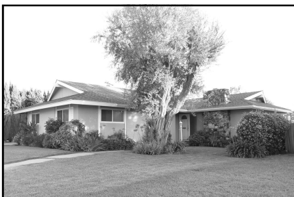
$324,900 3 bd/2 bth 1560 sq ft, turn key with central air/heat, new paint, new windows, new roof! Almost everything is new! 2-car garage!

We LIVE in the neighborhood, we WORK in the neighborhood, we KNOW the neighborhood, we SELL the neighborhood!!!