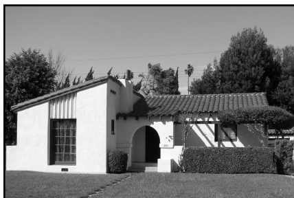
$449,900 3 bd/2 bth 2052 sq ft “Wood Street” Spanish- style with gorgeous hardwood floors, coved ceilings, wine cellar and 2-car garage!