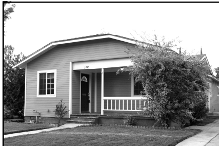
$345,000 3 bd/2 bth 1455 sq ft, complete home makeover with brand new kitchen, double pane windows, central air/heat, newer roof, etc!!