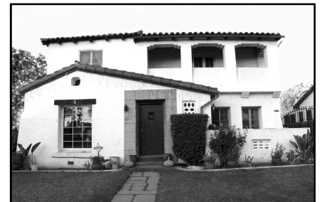
$595,000 4 bd/2 bth 3100 sq ft original Spanish Mediterranean Duplex (income property) with central air/heat, hardwood floors, 2-car garage!