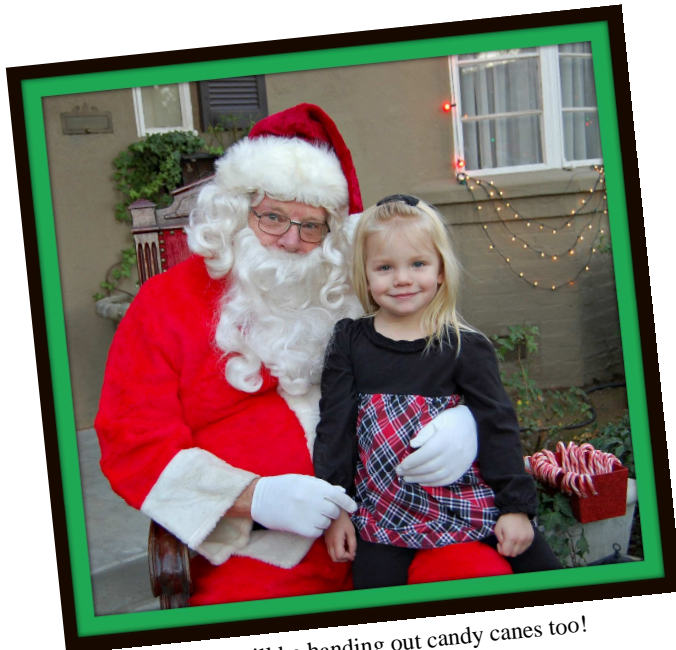
Santa will be handing out candy canes too!

Santa's helpers will be serving hot chocolate and cookies for children and adults. Don't forget your camera!