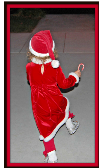
One of the many children from last year's event, skipping with joy after sitting on Santa's lap!

Santa's helpers will be serving hot chocolate and cookies for children and adults. Don't forget your camera!