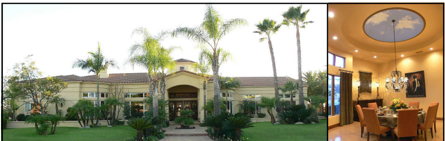
$1,599,000 7175 Golden Vale, Riverside -- Featuring dramatic interior living spaces, this palatial 5500 sq ft single-level contemporary Mediterranean estate is exceptionally suited to a social lifestyle yet also retains a casual elegance that makes it feel like “home”. Uncompromising quality is evident at every turn! This 4-bedroom, plus bonus room and library, 3.5-bath estate boasts a backyard which is rivaled only by Las Vegas’ Bellagio! Must see to believe! Featured property on www.thesisterteam.com .