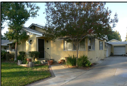
$224,900 4639 Brentwood -- 3 large bedrooms, 1.75 baths, approx 1400 sq ft, central air/heat, hardwood floors, bonus room, indoor laundry, above ground spa, private pool-sized backyard with alley access. What a “Wood Streets” deal!

Don’t hesitate to pass along our information to someone who may need help. Don’t wait or it may be too late. We are your real estate consultants for life and we can help in all areas of the real estate industry. We appreciate all referrals. And don’t forget, it IS a great time to buy, whether it be your very first home, a second home and/or investment property!