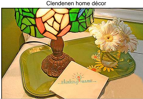
Clendenen home décor