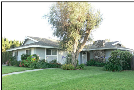
$324,900 3 bd/2 bth 1560 sq ft, turn key with central air/heat, new paint, new windows, new roof! Almost everything is new! 2-car garage!

We LIVE in the neighborhood, we WORK in the neighborhood, we KNOW the neighborhood, we SELL the neighborhood!!!