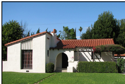
$449,900 3 bd/2 bth 2052 sq ft “Wood Street” Spanish- style with gorgeous hardwood floors, coved ceilings, wine cellar and 2-car garage!