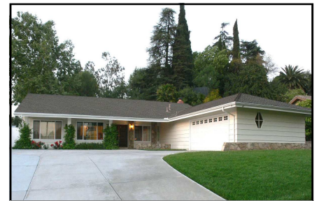
$456,000 4 bd/3 bth 2145 sq ft ranch-style in Canyon Crest on huge park-like lot with newer roof, new windows, central air, and RV parking!