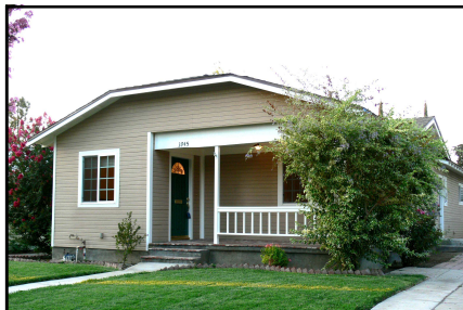
$345,000 3 bd/2 bth 1455 sq ft, complete home makeover with brand new kitchen, double pane windows, central air/heat, newer roof, etc!!