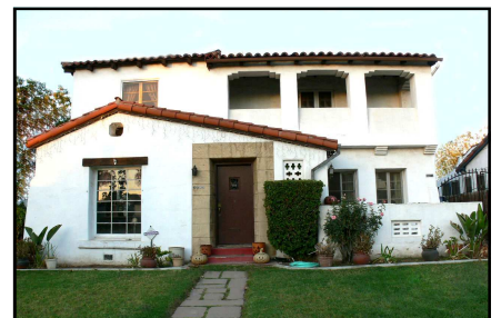
$595,000 4 bd/2 bth 3100 sq ft original Spanish Mediterranean Duplex (income property) with central air/heat, hardwood floors, 2-car garage!